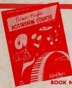
BOOK NO. 4