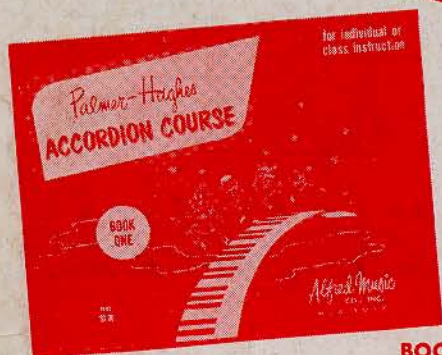
BOOK NO. 1