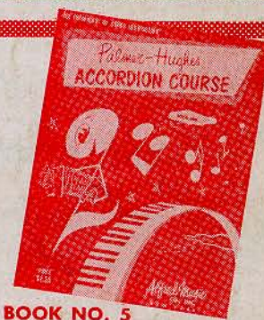
BOOK NO. 5