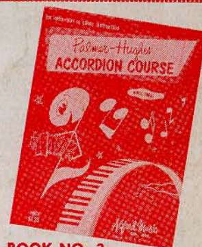
BOOK NO. 3